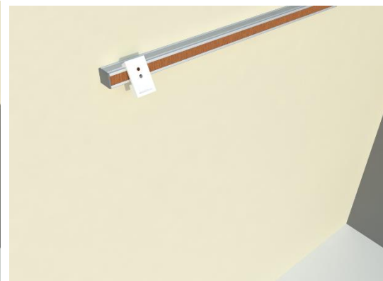
Step 3 Clip it on the rail