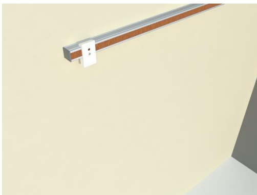
Step 7 The plate is now locked in place.