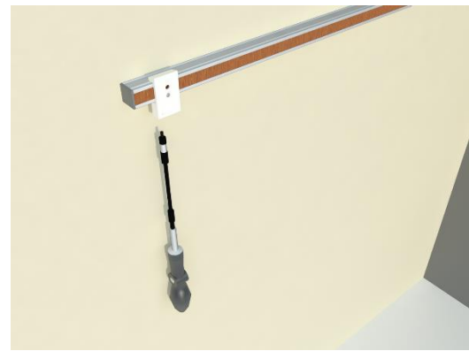
Step 5 Take the Paladin provided flexible hex driver