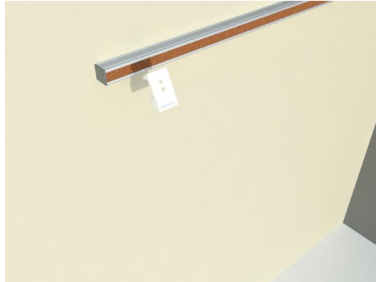
Step 2 Take the adapter