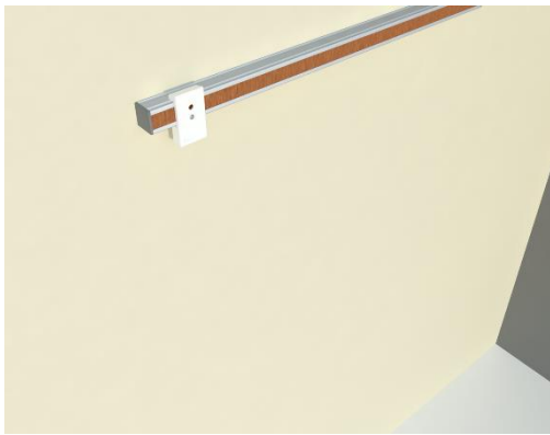
Step 4 Make sure the adapter is in the right place