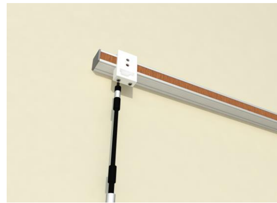
Step 6 Tighten the 2 allen screws